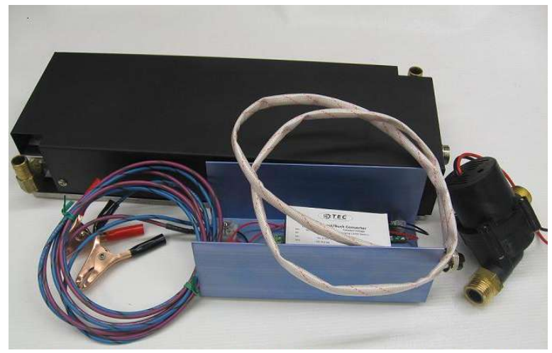
DESIGNED & MANUFACTURED IN CANADA

**There is an extra cost for a 24V DC to DC Converter. (*OUTPUT BASED ON MAXIMUM HOT SIDE TEMPERATURE and DT)